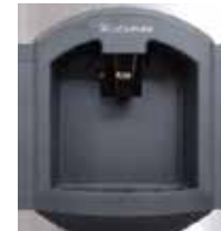
Easy Push Chute