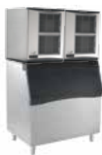
F1222 side by side on B948S