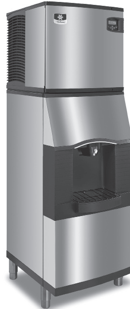
Indigo Series 522 Ice Machine SFA-191 Ice & Water Dispenser

Designed for "large" container ice filling. Accepts up to 10.5" (26.67 cm) high container