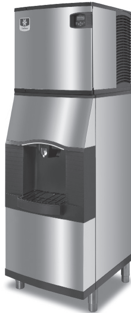
Indigo Series 522 Ice Machine SPA-160 Ice Dispenser

Designed for ice bucket filling in hotels, motels, and resorts