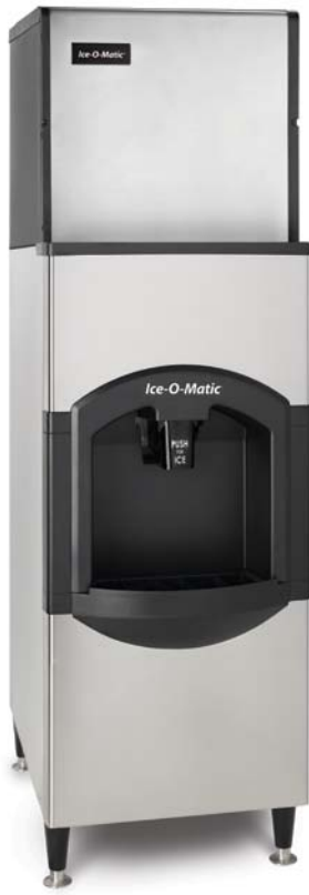
CD40022 WITH ICE0320